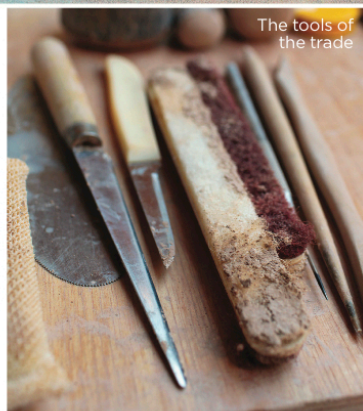
The tools of the trade