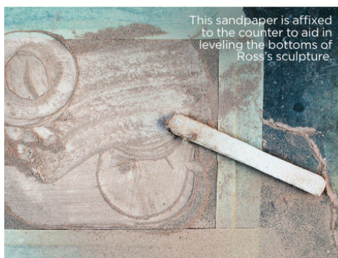
This sandpaper is affixed to the counter to aid in leveling the bottoms of Ross's sculpture.