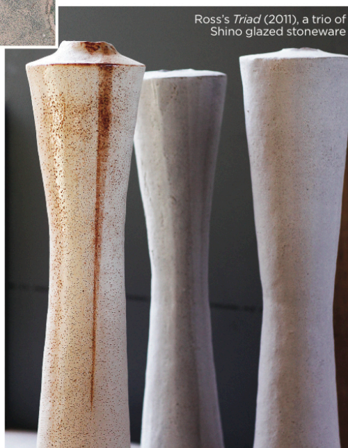
Ross's Triad (2011), a trio of Shino glazed stoneware